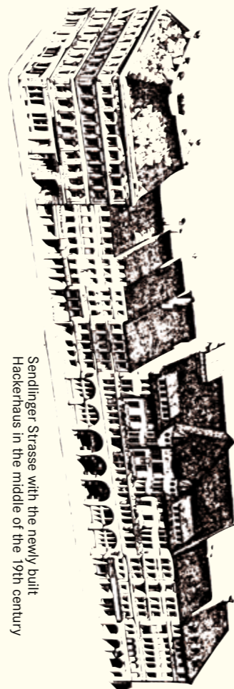
Sendlinger Strasse with the newly built Hackerhaus in the middle of the 19th century