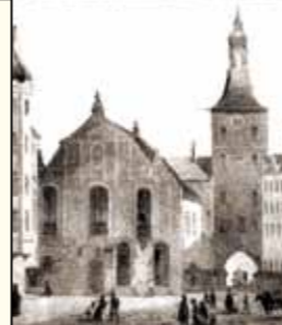
Town Hall - Rathaus