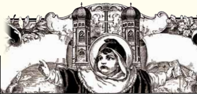
National Theatre - National Theater