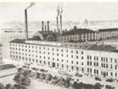
The Hacker Brewery Munich 1917