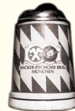
People, animals, Pschorr-Bräu Beer