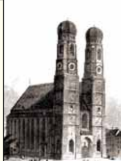
Church of Our Lady - Frauenkirche