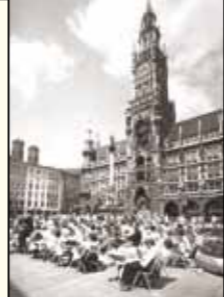
Maria Square - Marienplatz