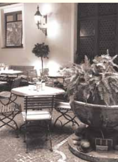
Beer garden in the inner yard