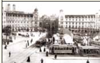
Karl Square - Karlsplatz