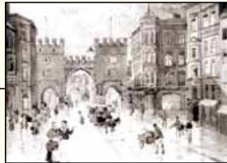
Karl Gate - Karlstor