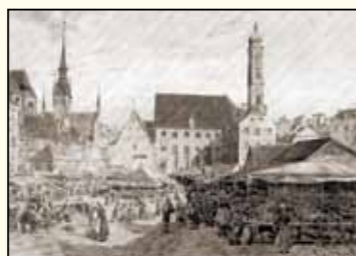
Viktualien Fruit and Vegetable Market - Viktualienmarkt