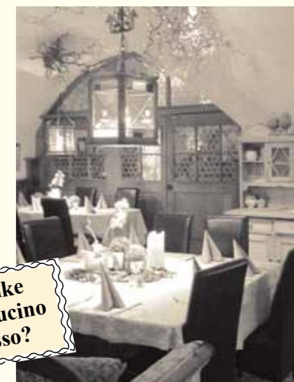
The »Schäftlerkeller« – a wonderful place for festivities for 10 to 150 people

Would you like some Cappuccino or Espresso?