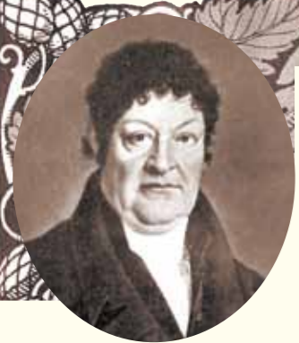
Joseph Pschorr 1770 – 1841

Feel free to take this menu home with you!