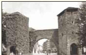
Sendlinger Gate - Sendlinger Tor